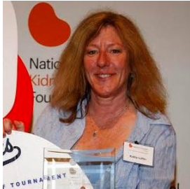
Outstanding 3rd Party Fundraiser of the Year: Ballers Invitational Golf